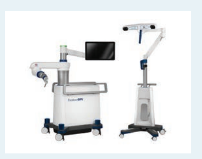
The Excelsius GPS robotic system is designed to assist neurosurgeons in spine surgeries.

Addition of the Siemens Healthineers technology will improve patient access to high-quality care and open new career opportunities at STHS through workforce development. The digital health solutions and performance improvement initiatives inherent in this strategic relationship will improve operations for patients and providers in the STHS network.