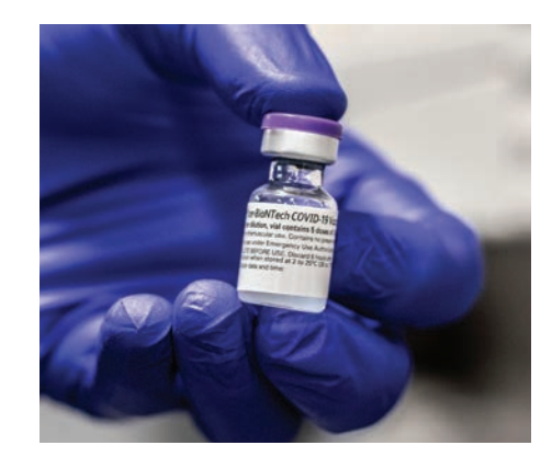
Vaccines and testing are two of the keys to keeping COVID in check, health experts say.

"Once delta began to wane, many people again thought we were through the worst of it - and then along came omicron."