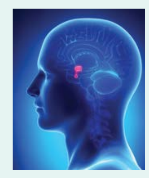
The pituitary gland, a pea-size gland located at the base of the brain, is part of the endocrine system and excretes hormones which regulate the body's internal functions.

In the summer of 2013, surgeons at St. Tammany Parish Hospital performed a minimally invasive endoscopic surgery to remove pituitary tumors that avoids cutting through the face or skull.